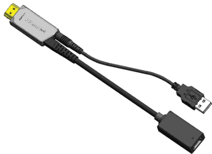
Figure 1: 998-DO-EXT

The 998-DO-EXT consists of a set of two HDMI type A to MPO Female dongle adapters. This design is easy to install and easy to upgrade.