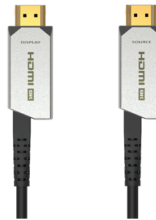
Figure 3: HDMI Connectors - SOURCE and DISPLAY (Dimensions in mm)