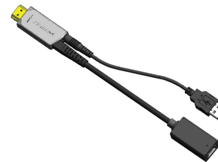
Figure 4: Attaching the Pulling Tool