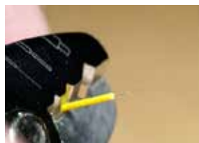
Strip an additional 20mm of cable jacket using the middle hole on the stripper