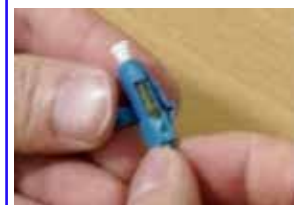
To remove or re-terminate the connector, simply unscrew the boot and replace the jig