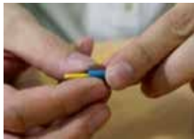
Insert the connector boot onto the cable

Tools Required: 3-hole stripper, Kevlar sheers, cleaver, ruler, marker