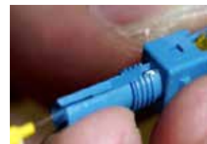
Insert the fiber into the connector body until the strand meets resistance and arches