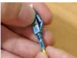
Screw the boot onto the connector body and trim any exposed Kevlar yarn