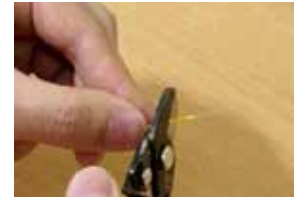
Strip 10mm of buffer using the small hole on the stripper