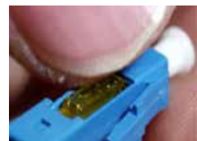
Lock the fiber inside the connector by pressing the amber button