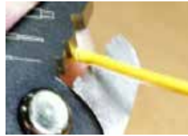
Strip 10mm of cable jacket using the middle hole on the stripper