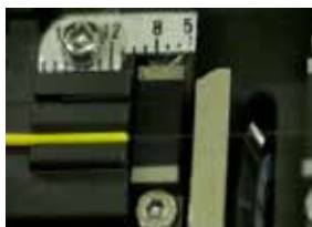
Cleave your fiber strand to 10mm from first measurement mark