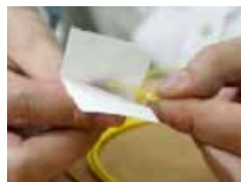
Clean any impurities from your cable