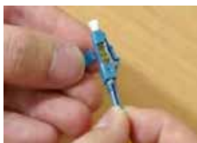
Remove the connector jig