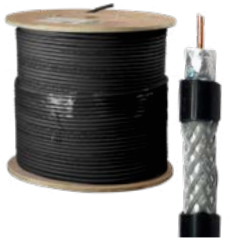
UL/ETL; CMP, CMR, CM, LSZH