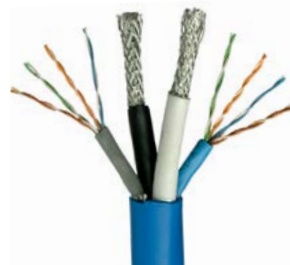
UL; CMR, CM