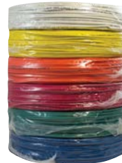
UL; CMR, CMP 9 Jacket Colors Available