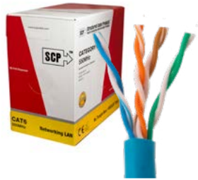
UL/ETL; CMP, CMR, CM, LSZH CPR EuroClass: Dca to B2ca