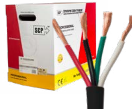
High Strand Count OFC UL; CMR CL3R, LSZH CPR EuroClass: Dca to B2ca