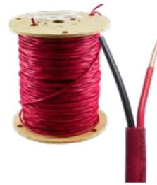
Multiple Jacket Colors Available