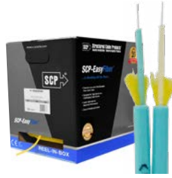
Bend Insensitive - "Installs like copper" OFNP, OFNR, LSZH CPR Rated Dca