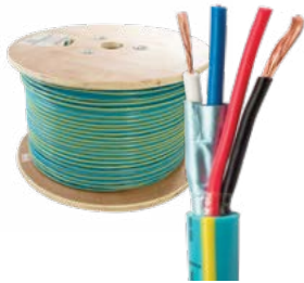
UL CMP, CM; LSZH CPR EuroClass: Dca