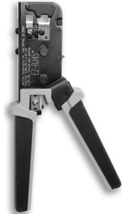
SCP Part #: EZ-Tool-Pro

SCP → Structured Cable Products™ Quality Installations Deserve Quality Products